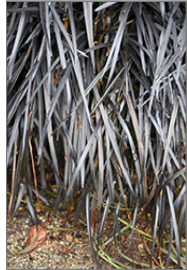
Black Mondo Grass foliage

Black Mondo Grass is a fine choice for the garden, but it is also a good selection for planting in outdoor pots and containers. It is often used as a 'filler' in the 'spiller-thriller-filler' container combination, providing a mass of flowers and foliage against which the thriller plants stand out. Note that when growing plants in outdoor containers and baskets, they may require more frequent waterings than they would in the yard or garden.