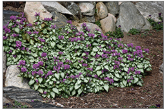
Purple Dragon Spotted Dead Nettle in bloom