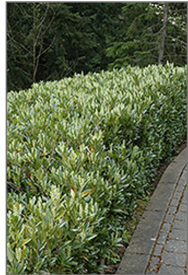
Otto Luyken Dwarf Cherry Laurel in bloom