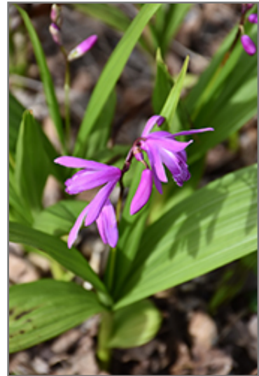
Lavender Japanese Hyacinth Orchid flowers