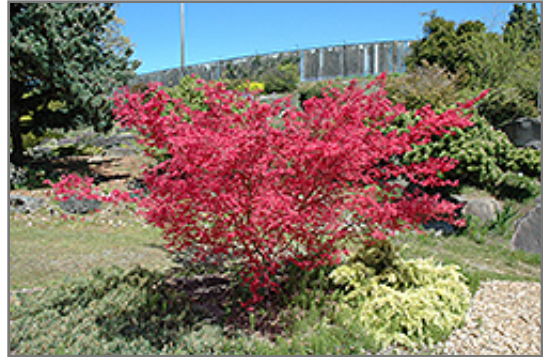
Shindeshojo Japanese Maple in spring

This tree does best in full sun to partial shade. You may want to keep it away from hot, dry locations that receive direct afternoon sun or which get reflected sunlight, such as against the south side of a white wall. It prefers to grow in average to moist conditions, and shouldn't be allowed to dry out. It is not particular as to soil pH, but grows best in rich soils. It is somewhat tolerant of urban pollution, and will benefit from being planted in a relatively sheltered location. Consider applying a thick mulch around the root zone in winter to protect it in exposed locations or colder microclimates. This is a selected variety of a species not originally from North America.