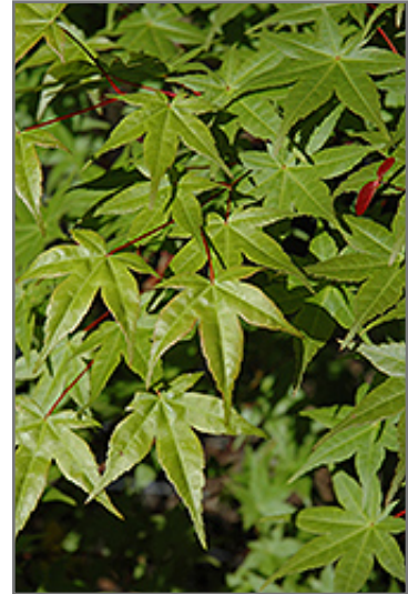
Shindeshojo Japanese Maple foliage