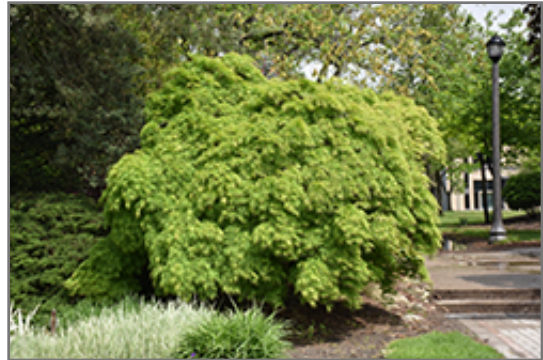
Cutleaf Japanese Maple