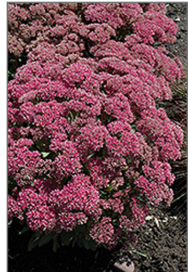
Mr. Goodbud Stonecrop flowers

Mr. Goodbud Stonecrop is recommended for the following landscape applications;