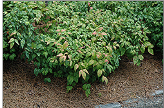
Fire Power Nandina