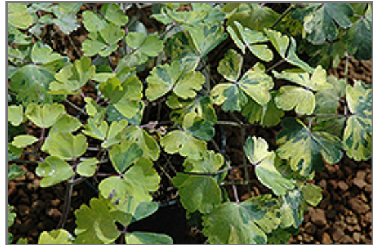
Leprechaun Gold Columbine foliage