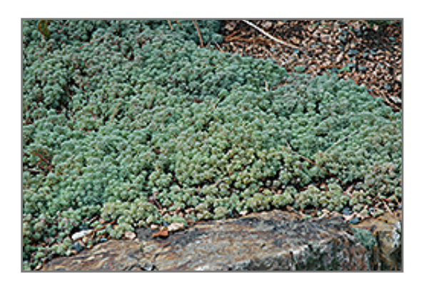
Spanish Stonecrop

Spanish Stonecrop is recommended for the following landscape applications;