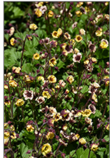
Tempo Yellow Avens flowers

Tempo Yellow Avens is recommended for the following landscape applications;