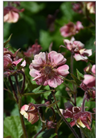
Tempo Rose Avens flowers

Tempo Rose Avens is recommended for the following landscape applications;