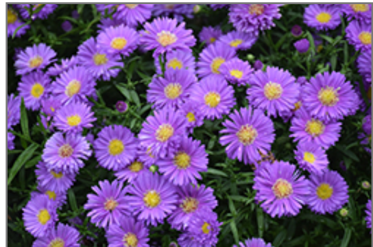
Magic Purple Aster flowers

Magic Purple Aster is recommended for the following landscape applications;