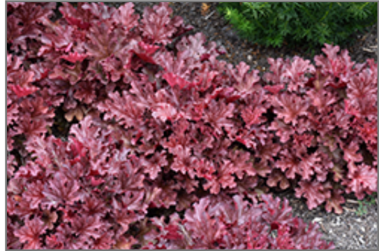
Ruby Tuesday Coral Bells

Ruby Tuesday Coral Bells is recommended for the following landscape applications;