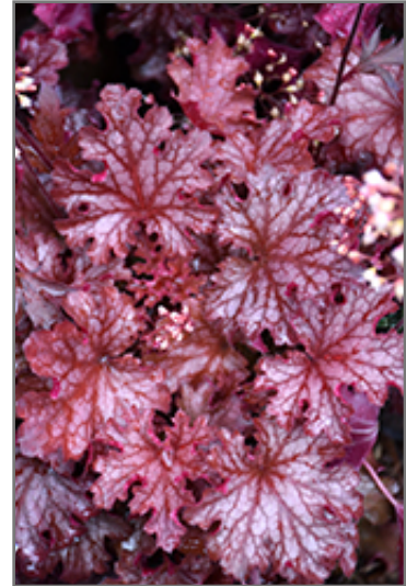
Ruby Tuesday Coral Bells foliage

Ruby Tuesday Coral Bells will grow to be about 9 inches tall at maturity extending to 16 inches tall with the flowers, with a spread of 14 inches. When grown in masses or used as a bedding plant, individual plants should be spaced approximately 12 inches apart. Its foliage tends to remain low and dense right to the ground. It grows at a medium rate, and under ideal conditions can be expected to live for approximately 10 years. As an evergreen perennial, this plant will typically keep its form and foliage year-round.