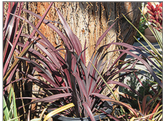
Dark Delight New Zealand Flax