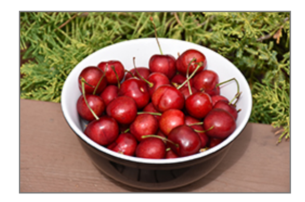
Sweetheart Cherry fruit