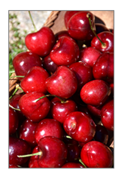
Sweetheart Cherry fruit