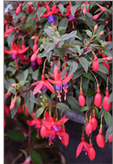
Army Nurse Fuchsia flowers