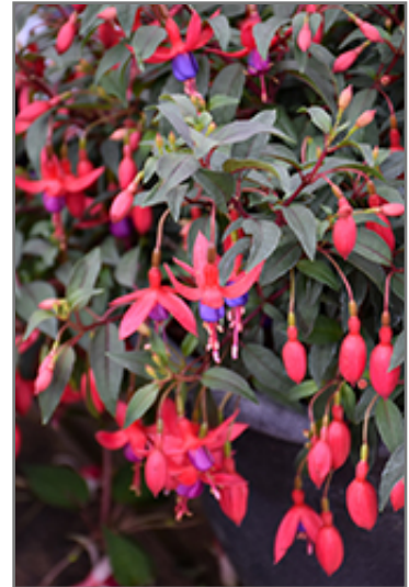
Army Nurse Fuchsia flowers