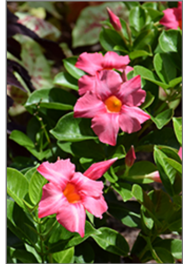
Madinia Coral Pink Mandevilla flowers

This tropical plant does best in full sun to partial shade. It requires an evenly moist well-drained soil for optimal growth. It is not particular as to soil type or pH. It is highly tolerant of urban pollution and will even thrive in inner city environments. This particular variety is an interspecific hybrid, and parts of it are known to be toxic to humans and animals, so care should be exercised in planting it around children and pets. It can be propagated by cuttings; however, as a cultivated variety, be aware that it may be subject to certain restrictions or prohibitions on propagation.