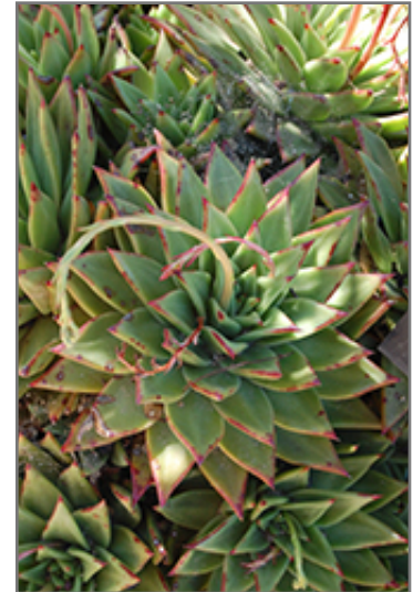
Molded Wax Echeveria foliage