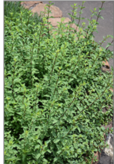
Hopley's Oregano