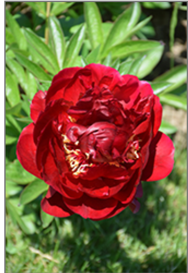
Buckeye Belle Peony flowers