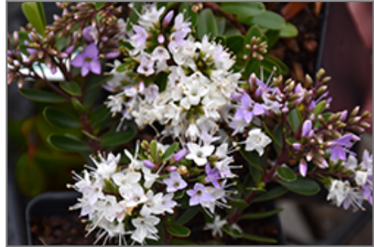
Patty's Purple Hebe flowers

Patty's Purple Hebe is recommended for the following landscape applications;