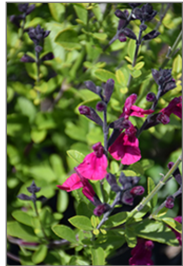
Vibe Ignition Fuchsia Sage flowers

Vibe Ignition Fuchsia Sage is a fine choice for the garden, but it is also a good selection for planting in outdoor pots and containers. With its upright habit of growth, it is best suited for use as a 'thriller' in the 'spiller-thriller-filler' container combination; plant it near the center of the pot, surrounded by smaller plants and those that spill over the edges. Note that when growing plants in outdoor containers and baskets, they may require more frequent waterings than they would in the yard or garden.