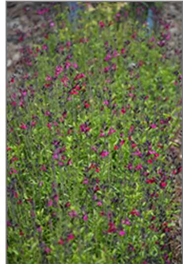
Vibe Ignition Fuchsia Sage in bloom