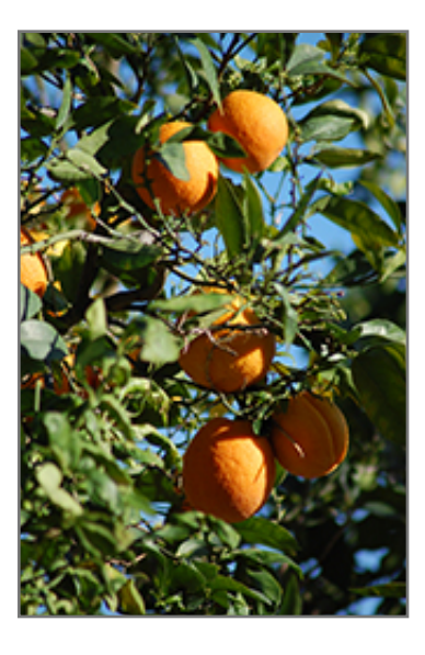
Moro Blood Orange fruit

Moro Blood Orange features showy clusters of fragrant white star-shaped flowers at the ends of the branches from late winter to early spring. It has dark green evergreen foliage. The glossy oval leaves remain dark green throughout the winter. It features an abundance of magnificent orange berries with red blush from late fall to late winter.