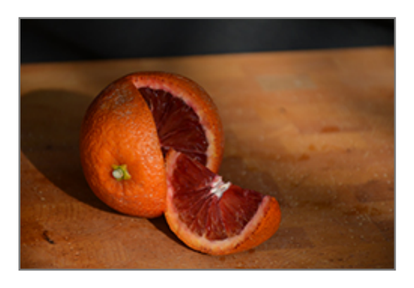
Moro Blood Orange fruit