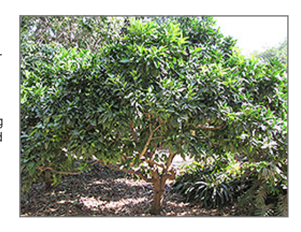
Moro Blood Orange

Moro Blood Orange is a good choice for the edible garden, but it is also well-suited for use in outdoor pots and containers. Its large size and upright habit of growth lend it for use as a solitary accent, or in a composition surrounded by smaller plants around the base and those that spill over the edges. It is even sizeable enough that it can be grown alone in a suitable container. Note that when grown in a container, it may not perform exactly as indicated on the tag - this is to be expected. Also note that when growing plants in outdoor containers and baskets, they may require more frequent waterings than they would in the yard or garden.