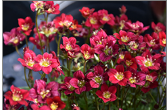
Touran Deep Red Saxifrage flowers