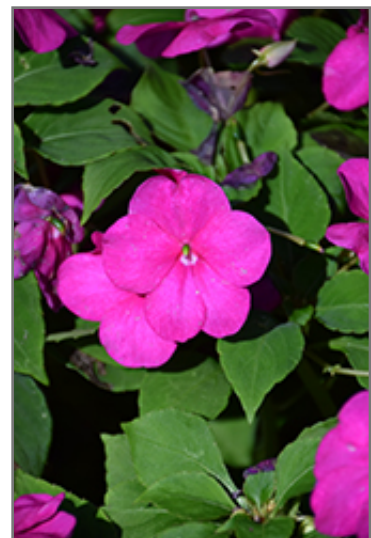
Beacon Violet Shades Impatiens flowers