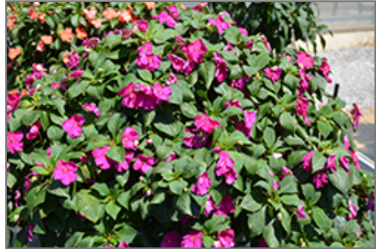
Beacon Violet Shades Impatiens in bloom

Beacon Violet Shades Impatiens will grow to be about 15 inches tall at maturity, with a spread of 12 inches. When grown in masses or used as a bedding plant, individual plants should be spaced approximately 8 inches apart. Its foliage tends to remain dense right to the ground, not requiring facer plants in front. This fast-growing annual will normally live for one full growing season, needing replacement the following year.