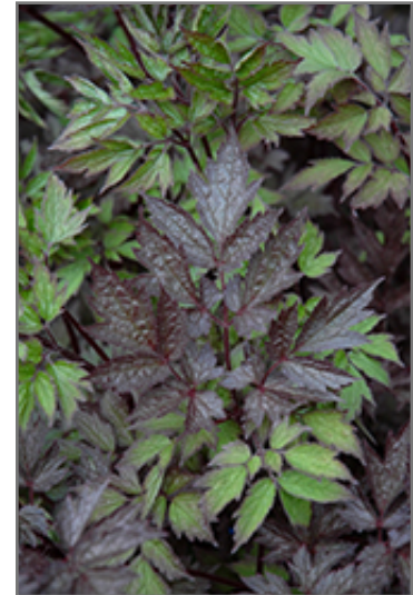
Black Negligee Bugbane foliage