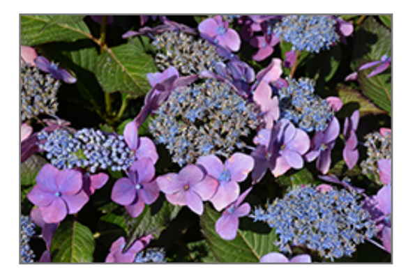
Seaside Serenade Outer Banks Hydrangea flowers