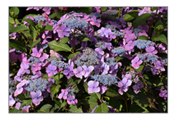
Seaside Serenade Outer Banks Hydrangea flowers