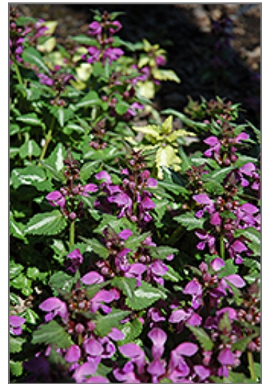
Elisabeth de Haas Spotted Dead Nettle flowers