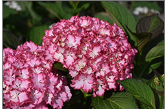
Seaside Serenade Fire Island Hydrangea flowers

This shrub will require occasional maintenance and upkeep, and should only be pruned after flowering to avoid removing any of the current season's flowers. It has no significant negative characteristics.