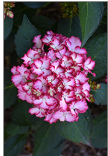
Seaside Serenade Fire Island Hydrangea flowers