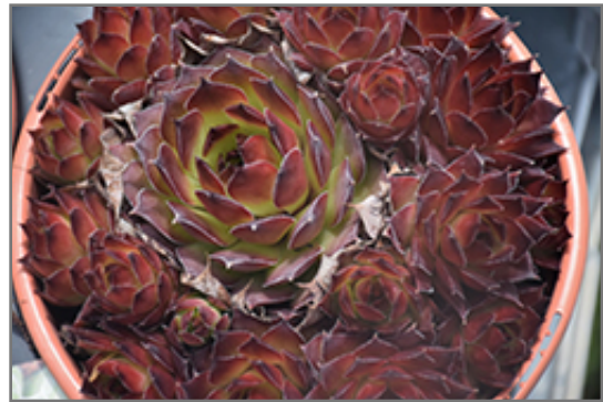
Black Hens And Chicks Photo courtesy of NetPS Plant Finder

Black Hens And Chicks is a fine choice for the garden, but it is also a good selection for planting in outdoor pots and containers. It is often used as a 'filler' in the 'spiller-thriller-filler' container combination, providing a canvas of foliage against which the larger thriller plants stand out. Note that when growing plants in outdoor containers and baskets, they may require more frequent waterings than they would in the yard or garden.