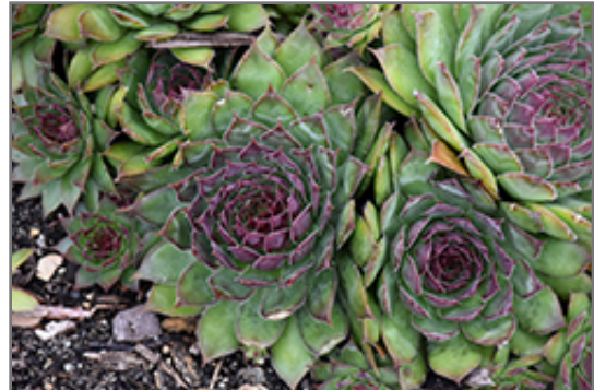
Black Hens And Chicks