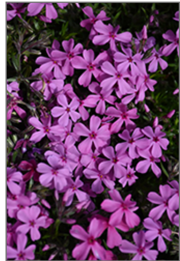
Spring Dark Pink Moss Phlox flowers

Spring Dark Pink Moss Phlox is recommended for the following landscape applications;