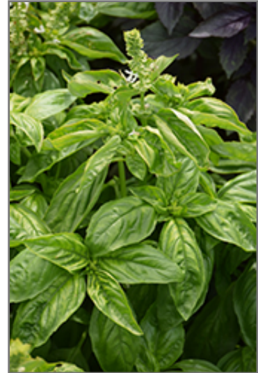
Genovese Basil foliage

Genovese Basil will grow to be about 20 inches tall at maturity, with a spread of 14 inches. When grown in masses or used as a bedding plant, individual plants should be spaced approximately 12 inches apart. This fast-growing annual will normally live for one full growing season, needing replacement the following year.