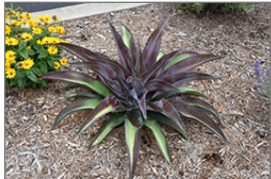
Mission to Mars Mangave

Mission to Mars Mangave is recommended for the following landscape applications;