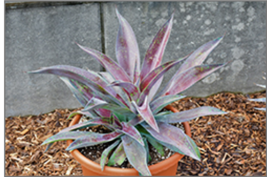
Mission to Mars Mangave

Mission to Mars Mangave will grow to be about 10 inches tall at maturity, with a spread of 22 inches. It grows at a fast rate, and under ideal conditions can be expected to live for approximately 5 years. As an herbaceous perennial, this plant will usually die back to the crown each winter, and will regrow from the base each spring. Be careful not to disturb the crown in late winter when it may not be readily seen!