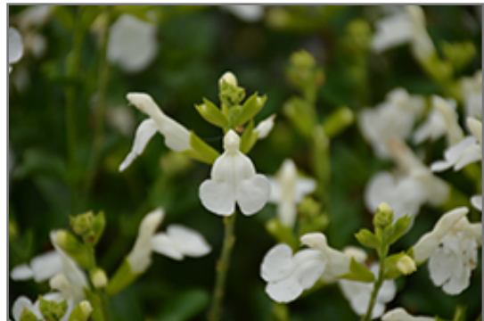
Mirage White Autumn Sage flowers

Mirage White Autumn Sage is recommended for the following landscape applications;