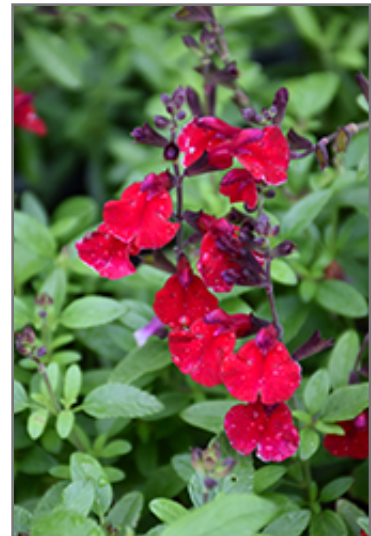
Mirage Cherry Red Autumn Sage flowers

This is a relatively low maintenance plant, and should only be pruned after flowering to avoid removing any of the current season's flowers. It is a good choice for attracting bees, butterflies and hummingbirds to your yard, but is not particularly attractive to deer who tend to leave it alone in favor of tastier treats. It has no significant negative characteristics.