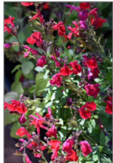
Mirage Cherry Red Autumn Sage flowers