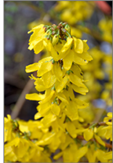
Magical Gold Forsythia flowers

Magical Gold Forsythia makes a fine choice for the outdoor landscape, but it is also well-suited for use in outdoor pots and containers. Because of its height, it is often used as a 'thriller' in the 'spiller-thriller-filler' container combination; plant it near the center of the pot, surrounded by smaller plants and those that spill over the edges. It is even sizeable enough that it can be grown alone in a suitable container. Note that when grown in a container, it may not perform exactly as indicated on the tag - this is to be expected. Also note that when growing plants in outdoor containers and baskets, they may require more frequent waterings than they would in the yard or garden.