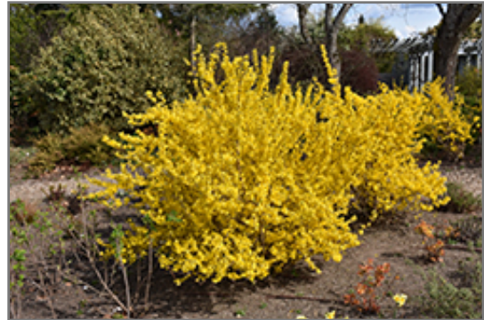
Magical Gold Forsythia in bloom