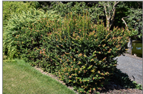
Thunderbird Evergreen Huckleberry