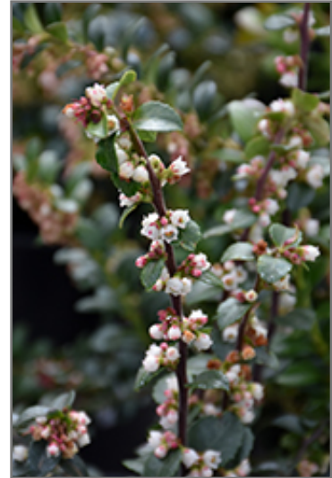
Thunderbird Evergreen Huckleberry flowers