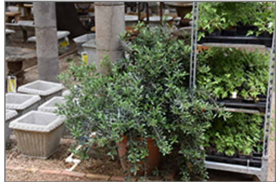
Little Ollie&reg Dwarf Olive