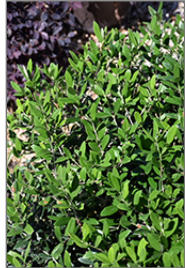
Little Ollie&reg Dwarf Olive foliage

Little Ollie&reg Dwarf Olive makes a fine choice for the outdoor landscape, but it is also well-suited for use in outdoor pots and containers. With its upright habit of growth, it is best suited for use as a 'thriller' in the 'spiller-thriller-filler' container combination; plant it near the center of the pot, surrounded by smaller plants and those that spill over the edges. It is even sizeable enough that it can be grown alone in a suitable container. Note that when grown in a container, it may not perform exactly as indicated on the tag - this is to be expected. Also note that when growing plants in outdoor containers and baskets, they may require more frequent waterings than they would in the yard or garden.