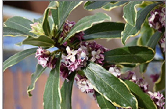
Moonlight Parfait Winter Daphne flowers