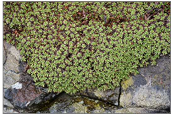
Cushion Bolax

Cushion Bolax is recommended for the following landscape applications;