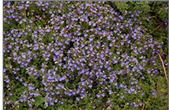
Turkish Speedwell in bloom

Turkish Speedwell is recommended for the following landscape applications;