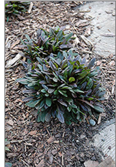
Chocolate Chip Bugleweed