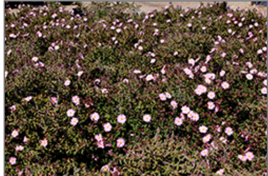
Pink Rockrose in bloom