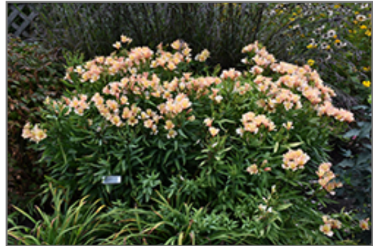
Inca Ice Alstroemeria in bloom