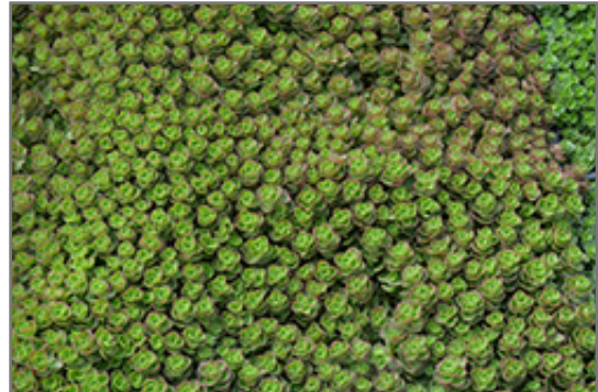
Dragon's Blood Stonecrop foliage