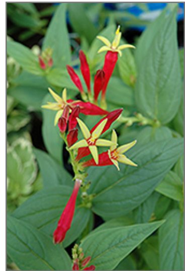
Indian Pink flowers