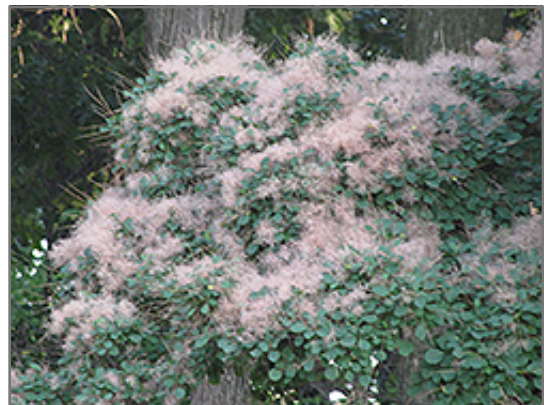
American Smoketree in bloom