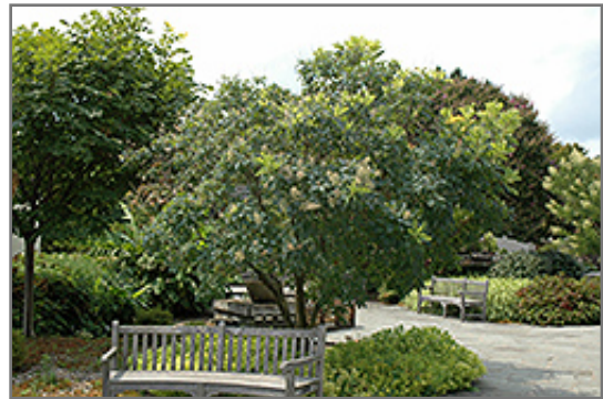
American Smoketree in bloom

American Smoketree is recommended for the following landscape applications;