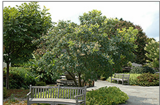
American Smoketree in bloom

American Smoketree is recommended for the following landscape applications;