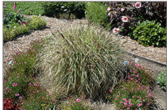
Ginger Love Fountain Grass