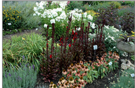
Vulcan Red Lobelia in bloom